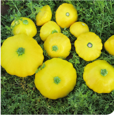
Morning Star F1