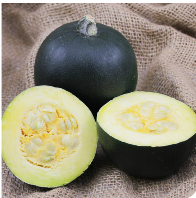
Star Gem F1