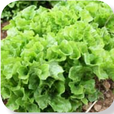
DELTONA Lactuca sativa