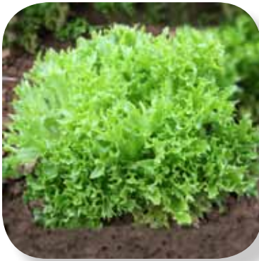
PIZAZZ Lactuca sativa