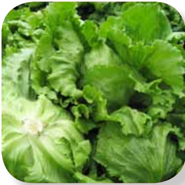
THREDBO Lactuca sativa