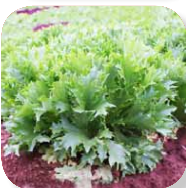
JAZZMO Lactuca sativa