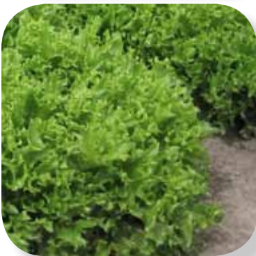
FRIZZMO Lactuca sativa

Flame is ideal for the whole head processing markets, and is suited to year round production.