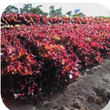
MERULINA Lactuca sativa

Jazzmo is ideal for the baby leaf and whole head processing markets, and is suited to year round production.