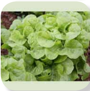
SHAMROCK Lactuca sativa

Rosea is ideal for the baby leaf and whole head processing markets, and is suited to spring and autumn harvesting.