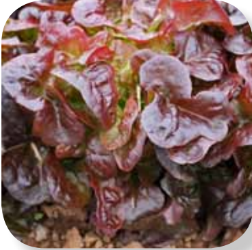
FLAME Lactuca sativa