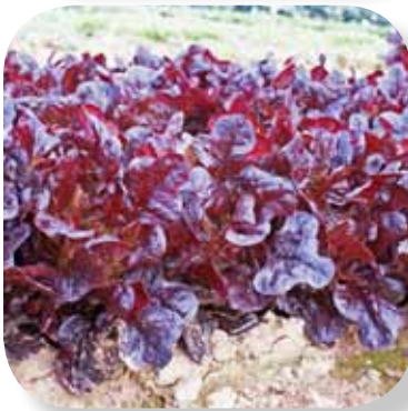
ROSEA Lactuca sativa

Pizazz is ideal for the baby leaf and whole head processing markets, and is suited to harvesting in late spring and early winter.